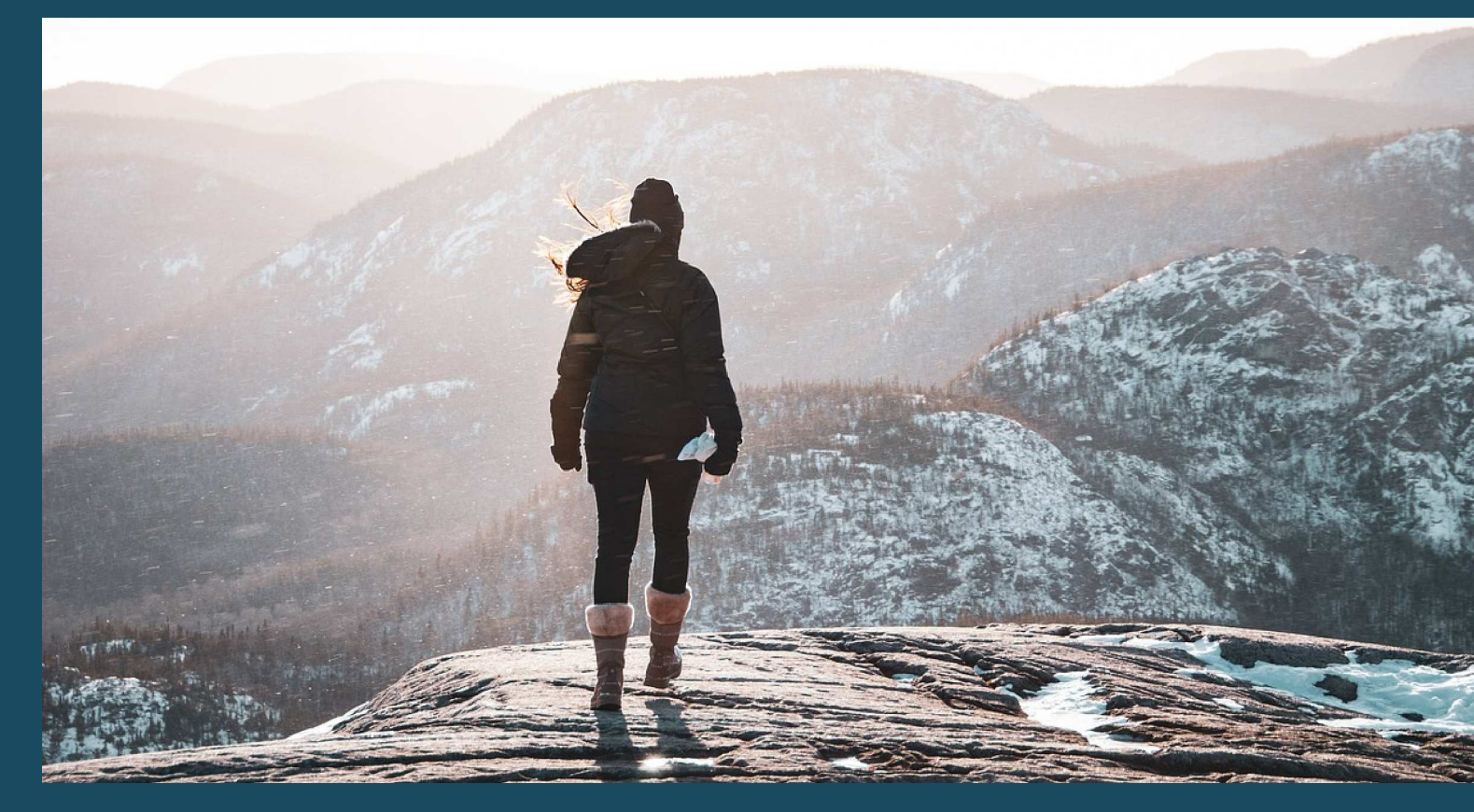
Working together to support your growth. Your success is our success.

Greck and Associates Limited (Greck) was established in 2000 and continues to grow, providing modern and innovative solutions to a diverse number of projects specializing in civil, water resources, and environmental engineering. We are a boutique firm, called on by clients to solve unique challenges that require state of the art software, know how and expertise. Our ability to resolve challenges with stream lined solutions and recommendations have helped conservation authorities, municipalities and private landowners achieve more than they thought possible.